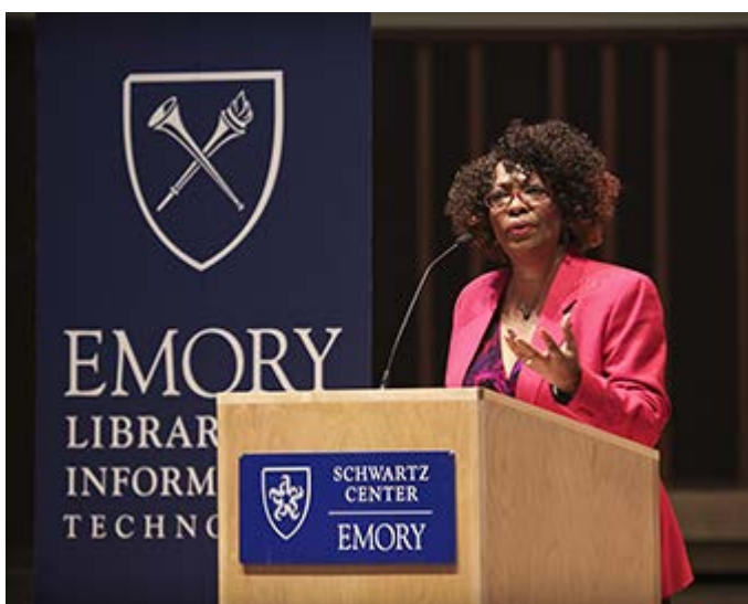
Rita Dove, pictured during her free poetry reading at Emory's Schwartz Center on Feb. 28.