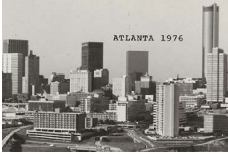
The downtown Atlanta skyline in 1976.

The panel, called "Changing Atlanta: Politics and Civic Engagement," begins at 6:30 p.m. on Tuesday, April 12, in the Jones Room at Emory's Woodruff Library. Panelists, who are also the exhibition curators, will discuss the issues brought on by growth and how city officials and citizens met those challenges.