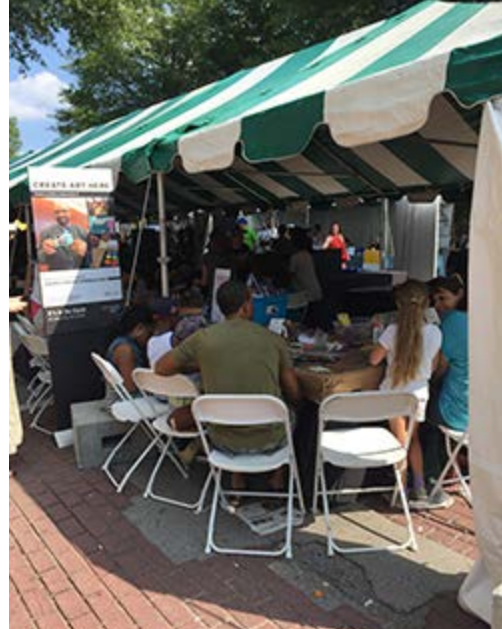
The art-making station in the Emory booth at the 2015 Decatur Book Festival.

Emory University, along with its libraries and other departments, is a proud platinum sponsor of the 2016 AJC/Decatur Book Festival on Labor Day weekend. Emory will host the keynote address at 8 p.m. on Friday, Sept. 2, at the Schwartz Center for the Performing Arts on campus. The event will feature Cassandra King Conroy, Rick Bragg; and other friends and family in a tribute to author Pat Conroy, who died in March.