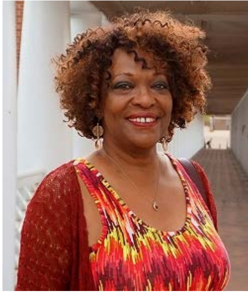
Rita Dove.

After her special appearance at our 12th Night Revel, Pulitzer Prize winner and former U.S. Poet Laureate Rita Dove will give a poetry reading at 4 p.m. on Sunday, Feb. 28, at the Schwartz Center for the Performing Arts on the Emory campus. Afterward, Dove will sign books and broadsides, both of which will be for sale at the reading. The event is free and open to the public, and no tickets are needed.