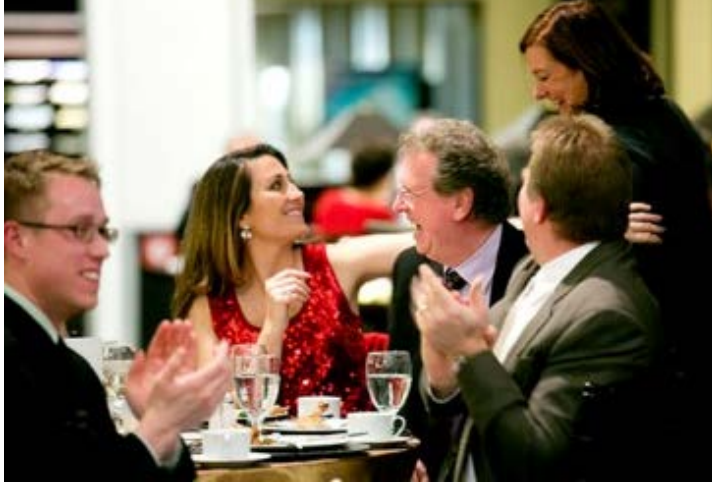
Guests enjoy a previous year's 12th Night festivities.

The intimate literary event will begin with a private cocktail reception in the Rose Library, where attendees are invited to explore items from the library's collections and take in views of Emory's campus and Atlanta. The event will also include a seated dinner in Schatten Gallery, with poetry readings by former U.S. Poet Laureate Rita Dove and other invited guests.