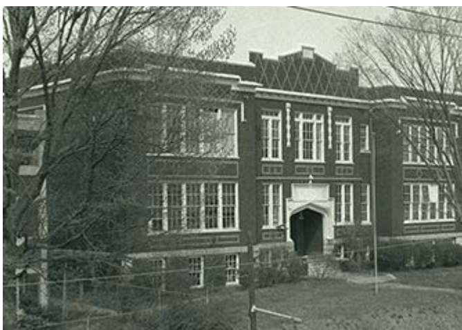
Nexus leased an old elementary school on Forrest Avenue (now Ralph McGill Boulevard) in 1976 and expanded its programs.

The event is in conjunction with "Artists' Books and Archives from Atlanta Contemporary Art Center, Nexus Contemporary Art Center, and Nexus Press," an exhibit of materials from the collection on display until May 15 in the Woodruff Library.