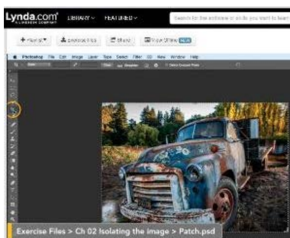
This screenshot of a Photoshop tutorial depicts one of the thousands of videos offered by Lynda.com.