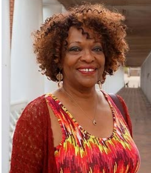
Rita Dove.

Pulitzer Prize-winning poet and former U.S. Poet Laureate Rita Dove will give a free reading at the Schwartz Center for the Performing Arts on the Emory University campus at 4 p.m. on Sunday, Feb. 28, 2016.