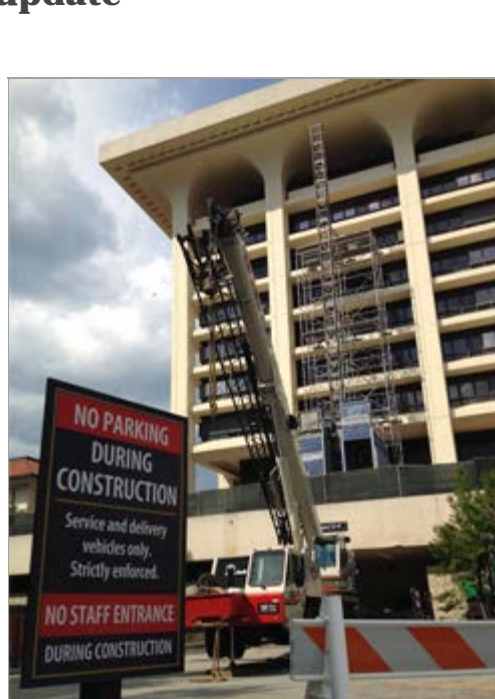
Image: Workers have built an outdoor elevator along the west side of the building to bring down concrete and other heavy debris during demolition.

Learn about MARBL's extensive renovation