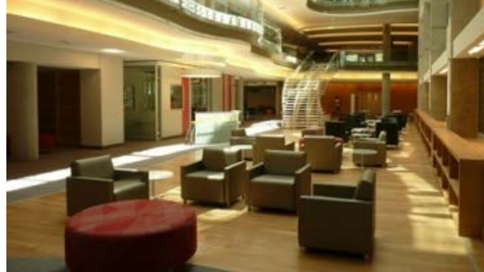
The Science Commons and the science library service desk in the new Atwood Chemistry addition.

It's been a busy summer of renovations for Emory Libraries , which has completed all of its major renovation projects that were scheduled to open in time for fall semester, which began Aug. 26. The Library Service Center, a joint project with Georgia Institute of Technology libraries, continues on schedule for its planned opening in spring 2016.