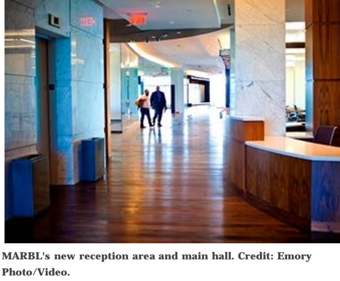
MARBL's new reception area and main hall.

After more than a year of construction, a completely renovated Manuscript, Archives, and Rare Book Library (MARBL) opened on Aug. 24 for research and instructional use. Opening celebrations and events will be announced in the near future.