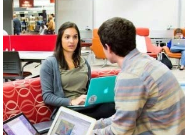
Students can now print from their laptops to any designated building printer.

Student Digital Life (SDL) at Emory University is debuting new services and spaces for the 2015-16 academic year that will expand opportunities for learning and creativity and increase space for studying and collaboration.