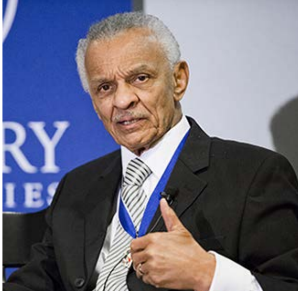
The papers of Rev. C.T. Vivian, a civil rights activist whose oral history is archived in the HistoryMakers database, are kept at the Rose Library.

The HistoryMakers Digital Archive is one of Emory Libraries' newest licensed databases, offering access to hundreds of full-length oral-history video interviews with nearly 1,200 African Americans in a variety of fields including business, medicine, the arts, education, religion, activism, politics, media, music, the military, sports and more. The licensed database is open to current Emory students, faculty and staff.