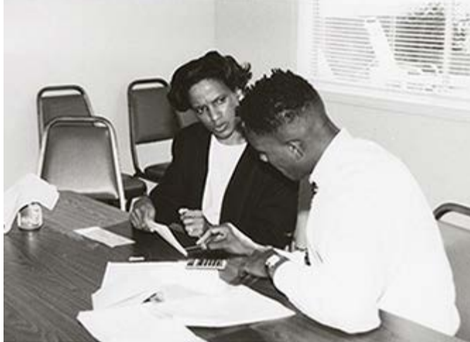
Staff of SCLC/W.O.M.E.N.'s National AIDS Program are pictured in this circa 1990 photo.