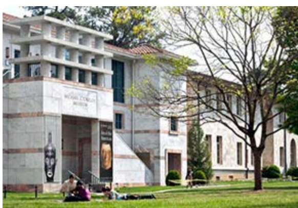
A view of the Carlos Museum from the Quad.

Four campus venues, including our Rose Library and Schatten Gallery (where the Billops-Hatch exhibition remains on view), have partnered with the Emory Alumni Association to give our friends a taste of Emory's arts scene at the inaugural Arts Stroll on Friday, March 17, from 6:30-9 p.m. A lovely evening is planned with light food and drinks at each location, starting with the Carlos Museum and ending with a performance at the Schwartz Center. There is no charge to participate, but advance registration is requested.