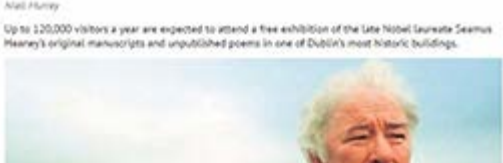
Using an extensive library archive donated by the Derry poet's family, the National Library of Ireland is working towards opening the exhibition in early 2018. It will be the first to be staged at a new cultural and heritage centre on College Green, part of the 18th-century Bank of Ireland building being made available to the State for 10 years.

Seamus Heaney exhibition to draw 120,000 visitors Saturday, September 24, 2016 Niall Finlay Up to 120,000 visitors a year are expected to attend a free exhibition of the late Nobel laureate Seamus Heaney's original manuscripts and unpublished poems in one of Dublin's most historic buildings.